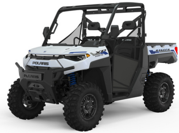
Colour: Icy White Pearl, Polaris Pursuit Camo

*Range estimates based on manufacturer data on typical customer driving usage and conditions. Actual range varies based on conditions such as external environment, weather, speed, cargo loads, rates of acceleration, vehicle maintenance, and vehicle usage.